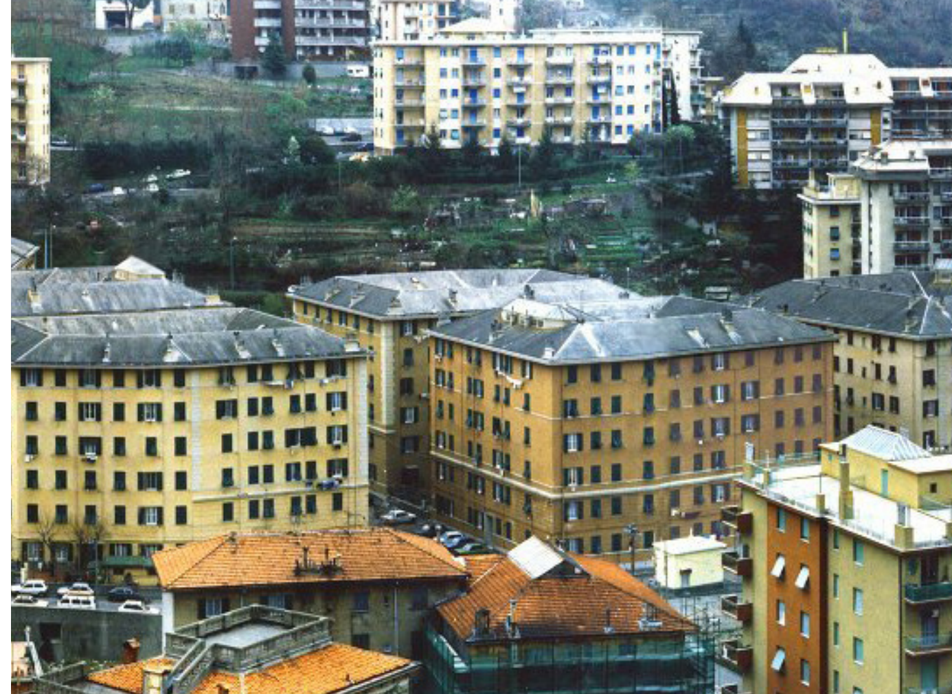
Quartiere Begato (left) and Quartiere Sertoli (right)

Public Service Concession for the energy retrofit (minimum 45%) and management of 67 SH buildings, reserved to certify ESCOs and divided in lots to favour SMEs. Further 10 SH buildings are being retrofitted through energy interventions financed in synergy with ERDF funds.